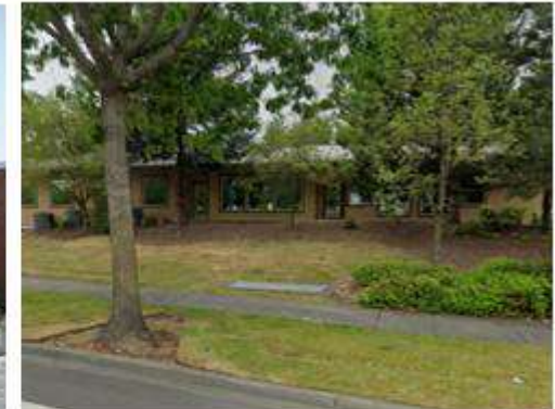
Abuse Intervention Center