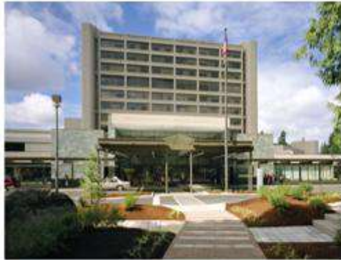
St Peter Hospital