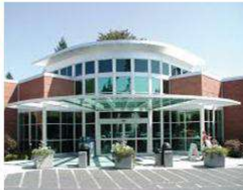
Regional Cancer System Lacey / Centralia